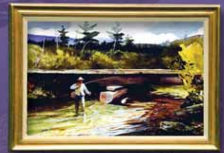
"Alder Brook" Watercolor Chel Reneson